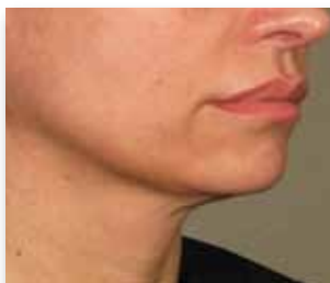
360 days post 1 treatment