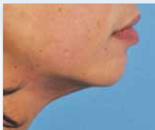
Immediate post treatment