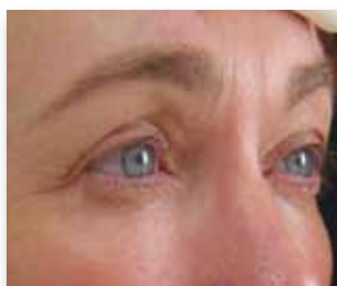
120 days post 1 treatment