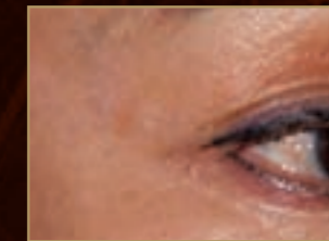
After the treatment