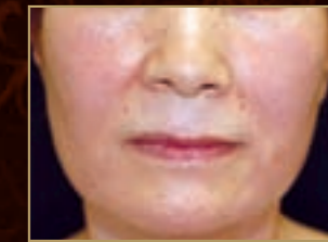
After 8 weeks