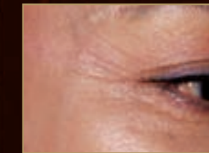
Before the treatment